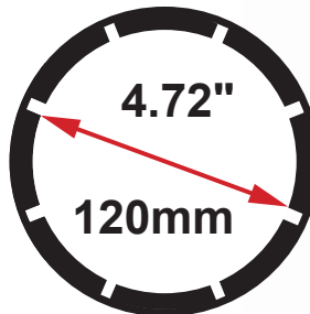
Max Head Opening W/O Dies