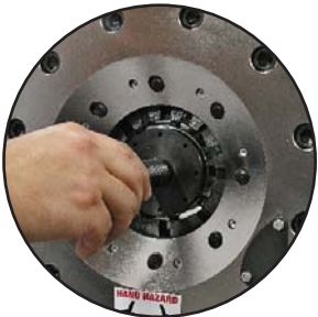
84mm Quick Change Tool (Included) P/N:102572

The features found on the CC38 Series hose crimper and the accessories included make it the best value of any crimper in its class.