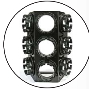
Die Rack 9 Station Die Holders (Optional) P/N:102616-84mm