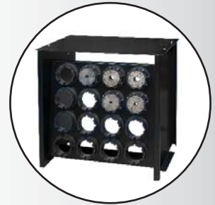
Crimper Stand 16 Station Die Holders (Optional) P/N:101247-84