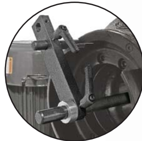
Manual Back Stop (Included) P/N:MBS-60