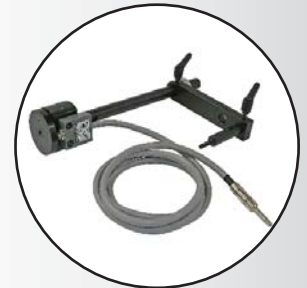
Electronic Back Stop (Optional) P/N:EBS-60