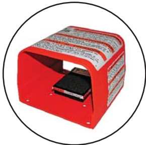
CC-Foot Switch (Included) P/N:CC-FOOTSWITCH