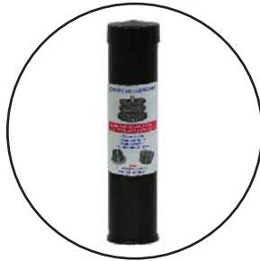
Available: CRIMPX Die Lubricant 3 oz mini grease tube P/N:103887