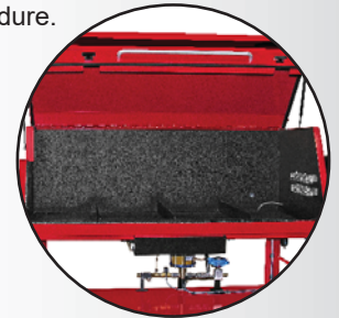
Large capacity cabinet to make large hose loading easy