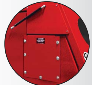
Removable Side Panel