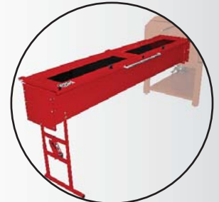
Available Extension Trough