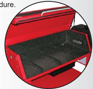
Large capacity cabinet to make large hose loading easy