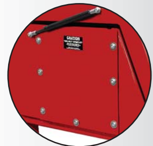
Removable Side Panel