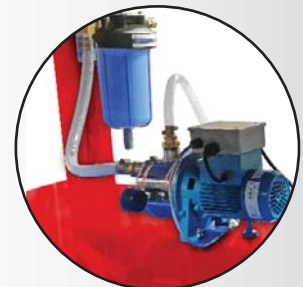
Available 90 PSI Booster Pump