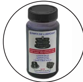
CRIMPX Die Lubricant Oil: 4 oz bottle with dauber cap (Included) P/N:103886