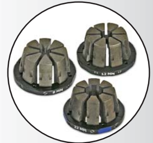
Custom die sets available