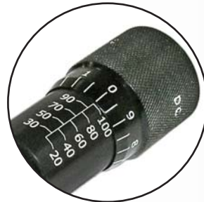
DC Micrometer (Optional) P/N:101489