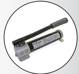
Hand Pump (Optional) P/N:VHP-10-25