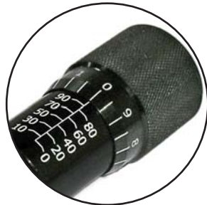
Standard Micrometer (Optional) P/N:100628