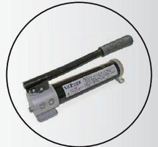
Hand Pump (Optional) P/N:VHP-10-25