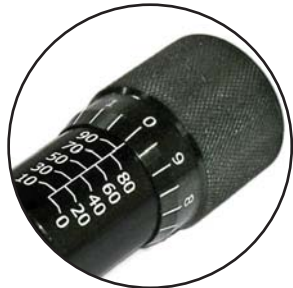
Standard Micrometer (Optional) P/N:100628