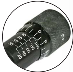
DC Micrometer (Optional) P/N:101489