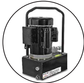
Multi-Electric Pump (Optional)