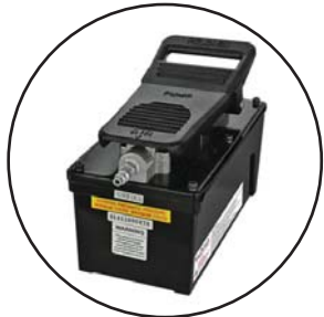
Pneumatic Pump (Optional) P/N:VAP-10-100