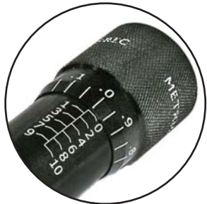
Metric Micrometer (Included) P/N:101587

The D100S Portable Series hose crimper paired with either a ValPower® Hand Pump, Pneumatic pump or Multi-Electric Pump make the perfect combination for portable crimping requirements.