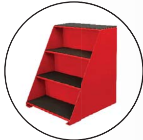
Die Storage Shelf (Optional) P/N:101431