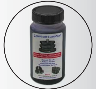
CRIMPX Die Lubricant: Oil 4 oz bottle with dauber cap (Included) P/N:103886