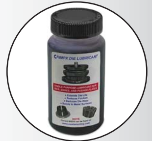
CRIMPX Die Lubricant Oil: 4 oz bottle with dauber cap (Included) P/N:103886