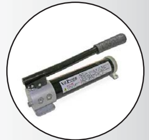
Hand Pump (Optional) P/N:VHP-10-43