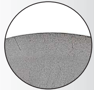
Double Bevel Blade with SS Slots: Is recommended for braided hose with minimum debris during the cut.