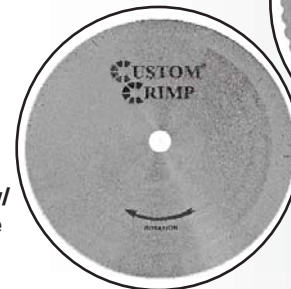
Double Bevel w/ SS Slots Blade